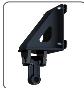
AGRICULTURAL BUCKET SIDE MOUNT