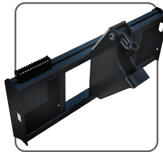
FIXED SKID STEER MOUNT