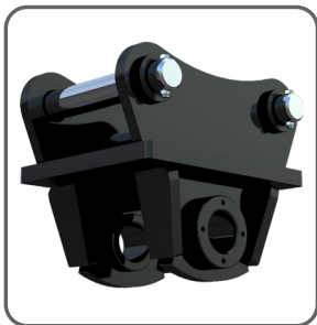
DOUBLE PIN EXCAVATOR MOUNT (FIXED AND LOOSE)