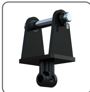
SINGLE PIN EXCAVATOR MOUNT