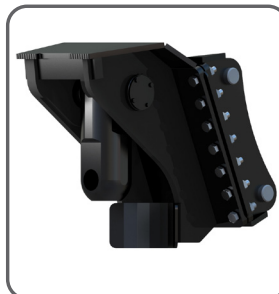
RYNO (PILING) HITCH